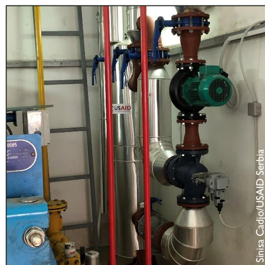
Temperature sensors and ancillary equipment at Ratko Jović