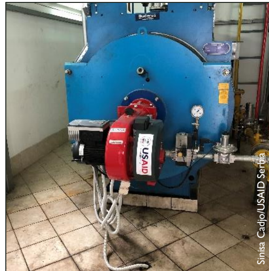
New burner (in red) at the DHC Niš Ratko Jović substation

The company also installed a new gas burner that better fits actual demand. The original design assumed a much larger heat load (by buildings that were never built), and the existing burner was operating far below its design capacity, causing substantial burner cycling (up to 160 times per day), which is very inefficient and wastes large volumes of natural gas. The original design included a 1.9 MW burner, but heat demand is less than 1 MW, meaning the burner is approximately twice the size needed. In addition, the substation's built-in elements are not compatible, so it is not possible to achieve optimum operating technology and operate the boiler room according to the appropriate regime.