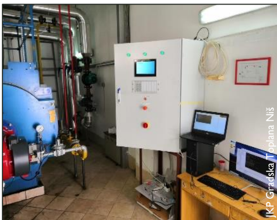
Automation system at Ratko Jović

DHC Niš resolved this issue by implementing a SCADA system to automatically control substation operation by reducing heat output based on customer demand and outdoor temperature, making the system significantly more energy efficient.